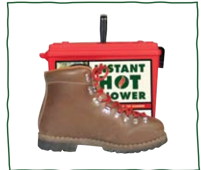
compact size, the Zodi hard case is about the size of a hiking boot

Portable and self-contained, the Hot Tap is one of our most popular instant hot showers. Equipped with push button ignition for extra convenience, enjoy unlimited hot water anytime, anywhere. Includes a rugged plastic storage case that doubles as a 4 gallon water container. The powerful water pump delivers great water pressure (requires 4 D-cell batteries). The Zodi Hot Tap On-Demand hot shower is great for family camping RVs and home emergencies. item no. 6185