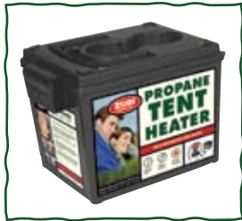
includes hard case

Our High-Performance heater is the #1 pick for hunters. Ideal for tents, trailers, or use in environments of extreme cold. A solid performer and proven winner, the double burner Hot Vent is the best choice for higher altitudes and 4 season camping. The fan requires 12-volt power. item no. 9184